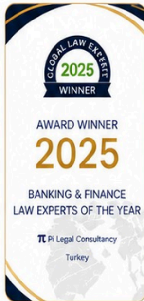
Banking & Finance Law Experts of the Year Global Law Experts 2025