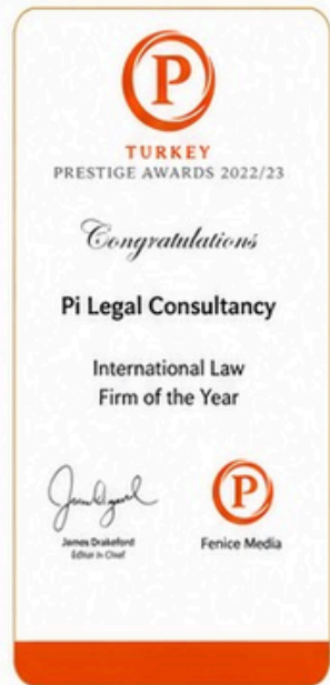
International Law Firm of the Year Prestige Awards (UK)

These recognitions highlight our commitment to delivering high-quality legal consultancy to both local and international clients.