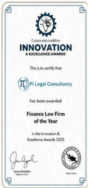
Finance Law Firm of the Year Corporate LiveWire Awards