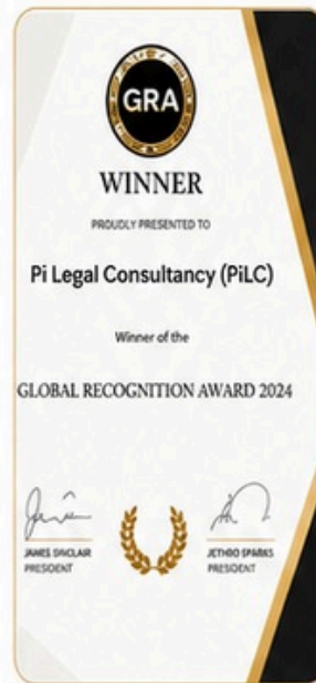
Global Recognition Award 2024