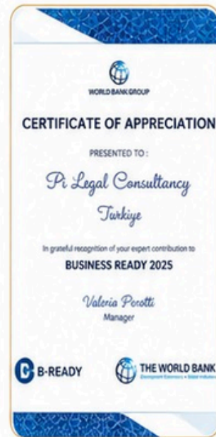
Certificate of Appreciation World Bank Group – B-Ready - Project